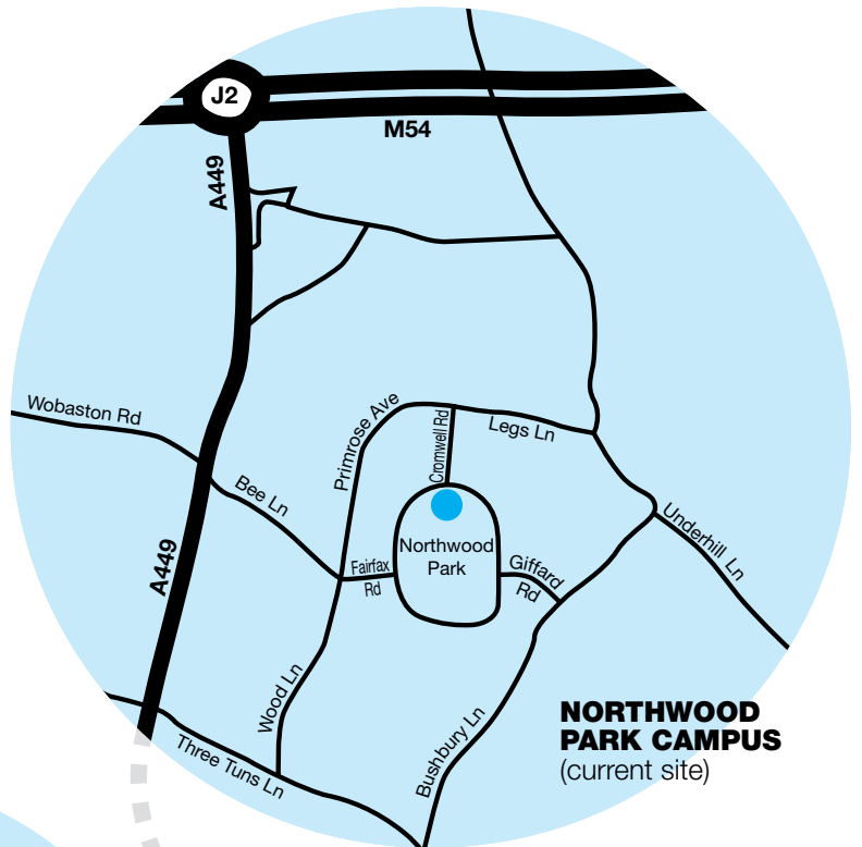
NORTHWOOD PARK CAMPUS (current site)